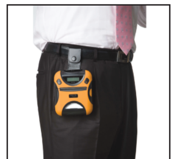
Belt Clip Included